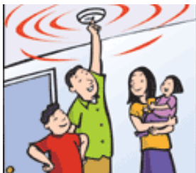
This is the time of year to check and replace batteries in your smoke and carbon dioxide

The winter holidays are a time for celebration, and that means more cooking, home decorating, entertaining and an increased risk of fire due to heating equipment.